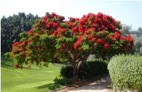
Figure 1: A beautiful Poinciana at WIS

Note: The total abstract length, including figures & refs, is limited to one A4 page.